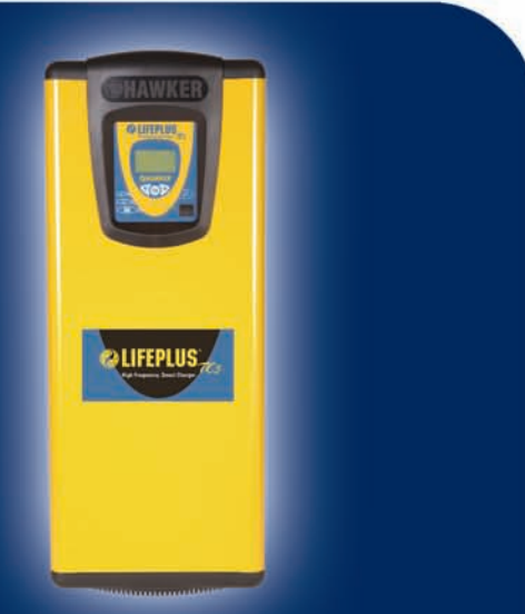
LIFEPLUS<sup>®</sup> TC3 - First in the Business... Best in the Business

Extended Battery Warranty – Because LIFEPLUS<sup>®</sup> delivers an optimal charge with less heat gain, the warranty on POWERLINE<sup>™</sup> and ENERGY-PLUS<sup>™</sup> batteries charged on LIFEPLUS<sup>®</sup> chargers is extended to 6-years or 1,800 cycles – an additional 20% life on your battery investment.